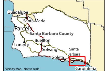
Vicinity Map - Not to scale