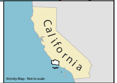
Vicinity Map - Not to scale