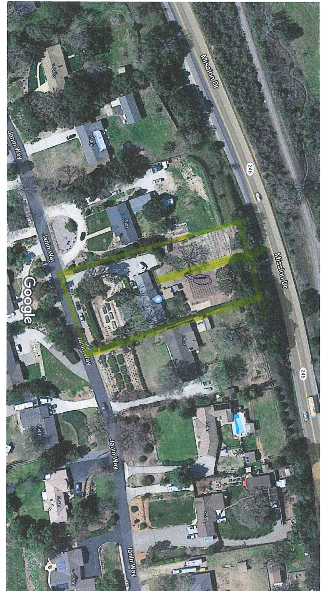
lmagery ©2022 Maxar Technologies, Map data ©2022