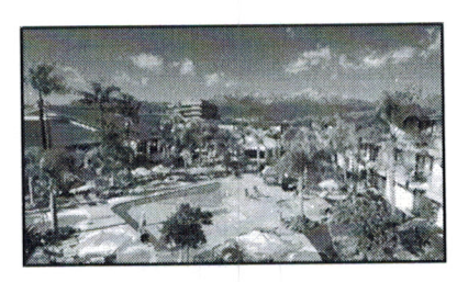
DoubleTree by Hilton, Ontario, CA

Note: Sessions are tentative and subject to change